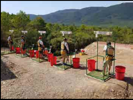
South African team practicing