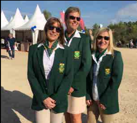
South African Ladies team